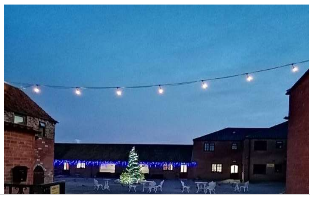
I think we can all agree December was a busy month!

We had a body shop party, some of our residents went to the over 60's christmas lunch at the local village hall. We had the residents christmas party with live music from Annie who dressed up ready for Christmas, that afternoon we had the Christmas light switch on at South Moor Lodge, the outside of the home looked incrediable, the staff have done an amazing job!